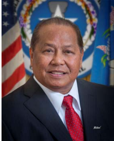
Governor Eloy S. Inos