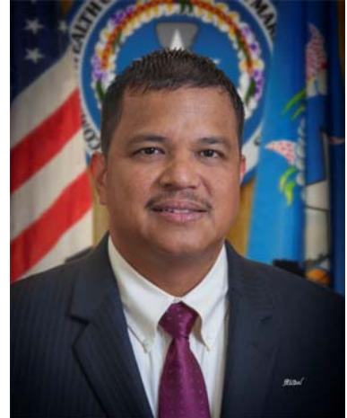
Lt. Governor Jude U. Hofschneider