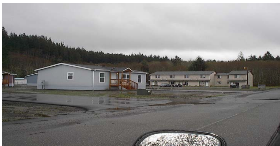
Makah Housing Authority and new housing development (2003).