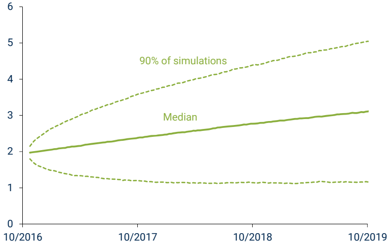
Figure 2 Simulated 10-year yield projections as of October 14, 2016

We focus on the simulated paths for the 10-year Treasury yield, which is a key benchmark for all financial institutions, but note that the results for the 50-year yields are qualitatively similar. Figure 2 shows the median and the range for the central 90% of the outcomes for the 10year yield from the simulated interest rate scenarios. The median rate indicates a continued gradual increase in the longterm interest rate, consistent with current market projections. The upper 95th percentile (top dashed line) rises more rapidly and reaches 5% after three years, while the lower 5th percentile (bottom