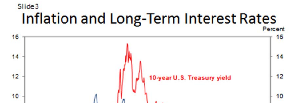
| Expectations | Core PCE inflation | 1960 | 1965 | 1970 | 1975 | 1980 | 1985 | 1990 | 1995 | 2000 | 2005 | 2010 | Inflation Expectations are from the Survey of Professional Forecasters; Core PCE Inflation is the 12-month change