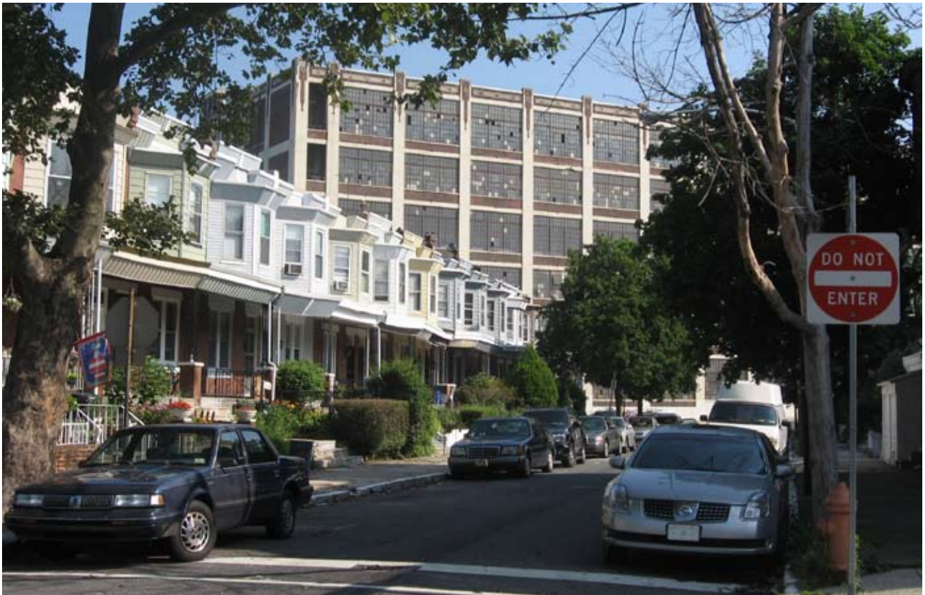
The physical legacies of its industrial past loom over Allegheny West, a neighborhood in North Philadelphia.