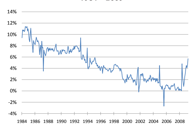
Figure 1.1 U.S. Personal Saving Rate 1984 – 2009

Seasonally adjusted, personal saving as a percentage of personal disposable income