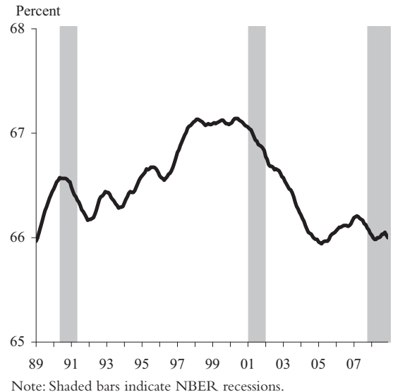
Figure 1 Historical labor force participation rate (12-month moving average)

By contrast, in the current downturn, the decline in housing wealth and credit availability is nearly