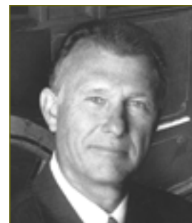
Richard M. Kovacevich Chairman, President, and Chief Executive Officer Wells Fargo & Company San Francisco, California