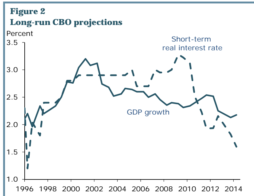
Figure 1 also shows that the CBO lowered its estimate of the short-term real interest rate by roughly 0.4 percentage point since the beginning of 2012. Echoing the views of FOMC participants, the latest report on the long-term budget outlook from the CBO (2014) emphasized that a key factor behind the declining real rate was the decline in potential growth. This link between potential growth and the natural real interest rate is also evident in the CBO’s projections since the mid-1990s, shown in Figure 2. The two series have a fairly close correlation of 0.5.

participants revised down their estimates of the longer-run federal funds rate, with a lower assessment of the longer-run level of potential output growth cited as a contributing factor for the majority of those revisions” (Board of Governors 2014).