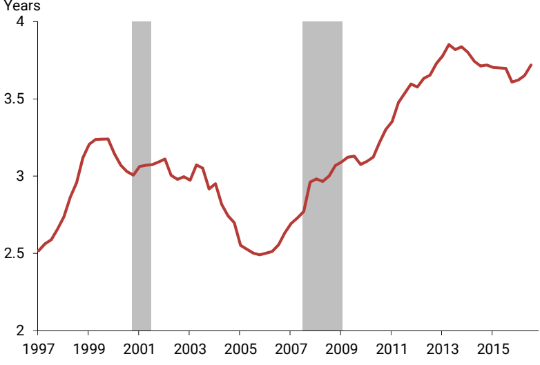
Figure 2 Maturity gap between bank assets and liabilities

Sources: Maturity gap is based on data from bank Call Reports; see Paul (2017a) for details. Gray bars denote NBER recession dates.