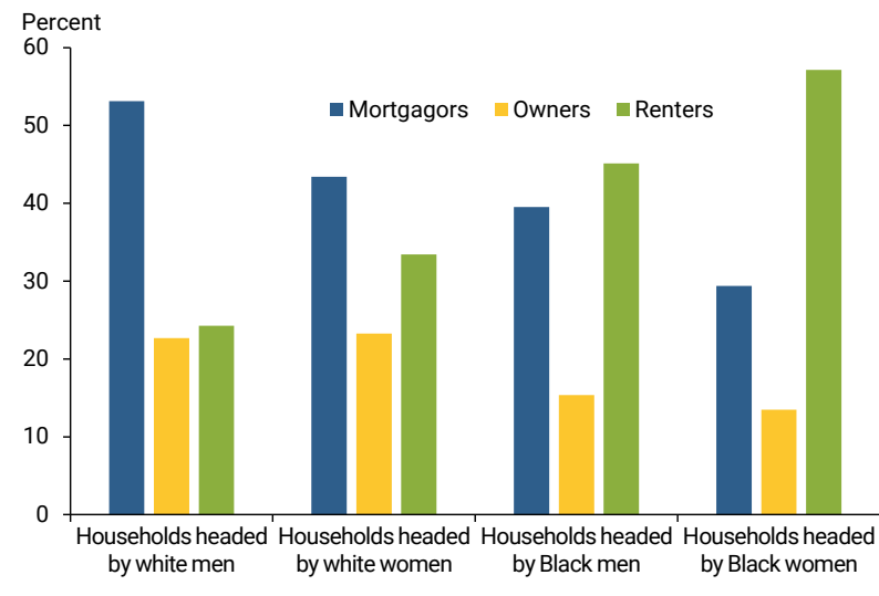
Figure 1 Mortgagor, owner, and renter shares by household type