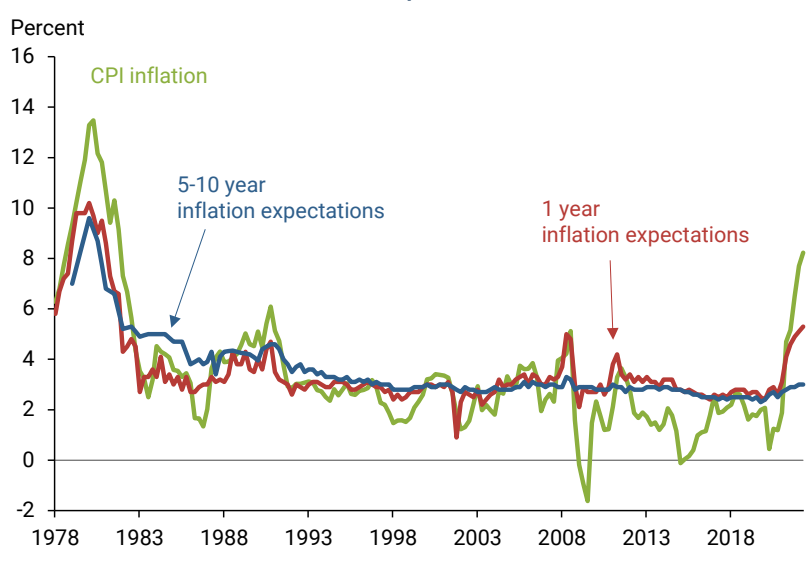
Figure 1 Price inflation and inflation expectations

Note: Consumer price index (CPI) inflation measured as four-quarter percent change. Source: BEA and University of Michigan; some missing 5-10 year expectations for the 1980s use interpolations from adjacent quarters or FRB Philadelphia's Livingston Survey.