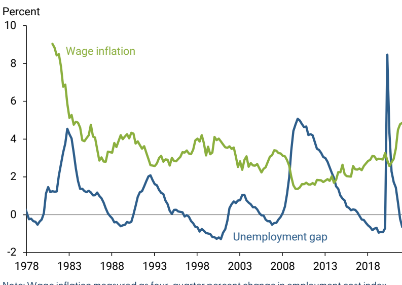
Figure 2 Unemployment gap and wage inflation

Note: Wage inflation measured as four-quarter percent change in employment cost index.