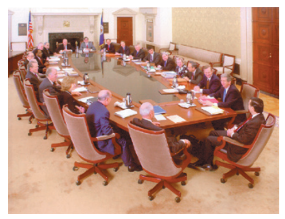
The FOMC deliberates around the famous table at the Board Room in Washington, D.C.

A. We (the members of the FOMC) go into the meetings with the benefit of a lot of briefings from our Research staffs. We all feel we're pretty well up-to-date