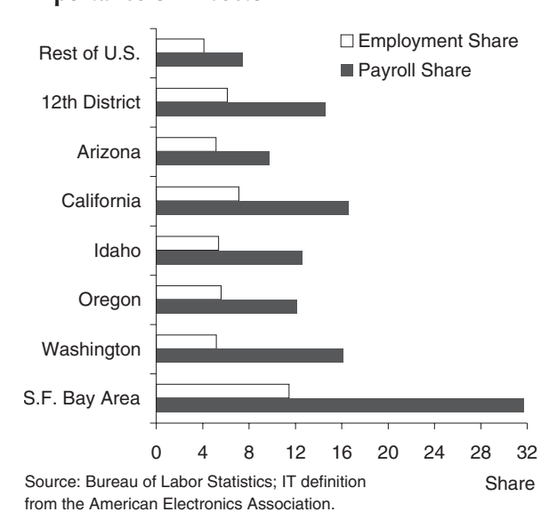
Figure 1 Importance of IT sector

about 1.5 times as dependent on IT as the rest of the U.S.