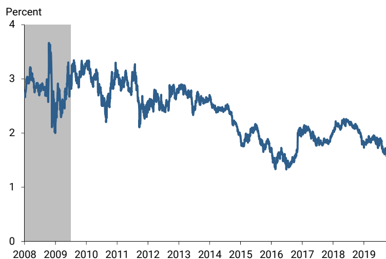
Figure 1 Implied Treasury inflation compensation, 5–10 years ahead

However, we cannot simply infer investors' expectations about inflation from looking at inflation compensation. Inflation risk premiums also affect how much compensation investors require to hold nominal Treasury securities. Therefore, we need a way to control for movements in inflation risk premiums to isolate changes in expected inflation from the changes in inflation compensation.