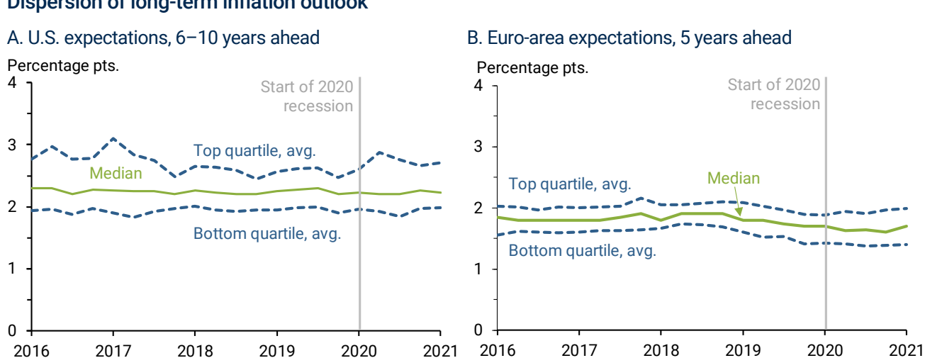
Figure 2 Dispersion of long-term inflation outlook

While the disagreement in short-term forecasts in the United States and euro area rose sharply with the pandemic, disagreement about the long-term inflation outlook has been much lower in both economies. Figure 2 presents analogous pictures of longer-term expectations, 6–10 years ahead for the United States and 5 years ahead for the euro area. In the United States, the median long-term inflation forecast has