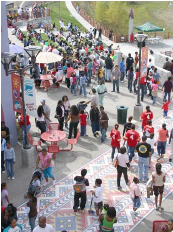
Residents walking along the Laotian Tile Tapestry, part of Market Creek Plaza's Cultural Tapestry Walkways

One final example is the Mission Asset Fund (MAF) in San Francisco, focused on place-based community and individual asset building. Initially envisioned as a traditional Individual Development Account program, the MAF emerged from an extensive series of community-based meetings which revealed that residents wanted to build communal assets to protect the rich cultural vibrancy of the neighborhood. 11 Since MAF's inception, it has helped fund worker-owned cooperative businesses such as Balloon Art Productions and Rental, and cooperatively owned homes in partnership with the San Francisco Community Land Trust.