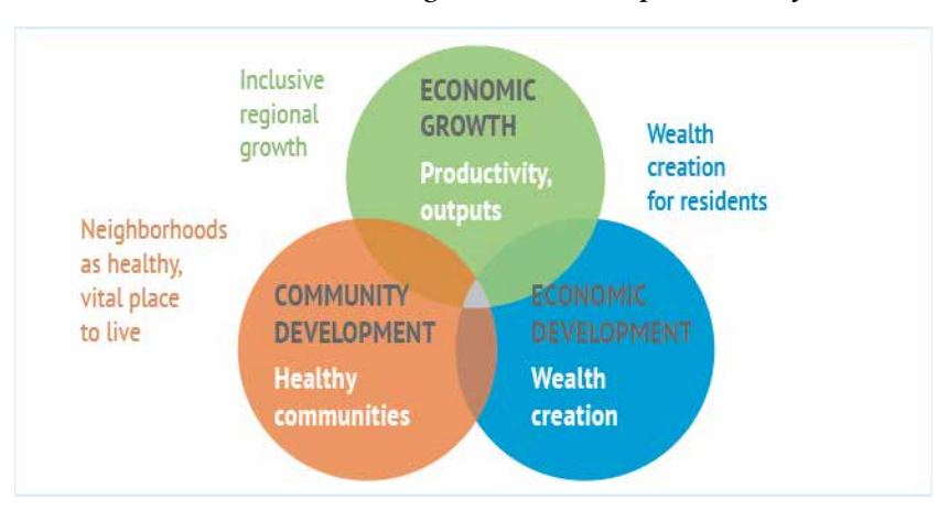
Inclusive Growth Planning and Other Development Activity

Inclusive economic growth seeks to understand and align these dynamics among communities, people, businesses, and regional markets to create communities with prosperous residents and businesses that participate in and constitute a vital and prosperous region.